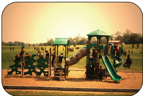
"The Future Starts Today, not Tomorrow" Saint John Paul II